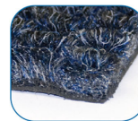
Straight Cut, Std.